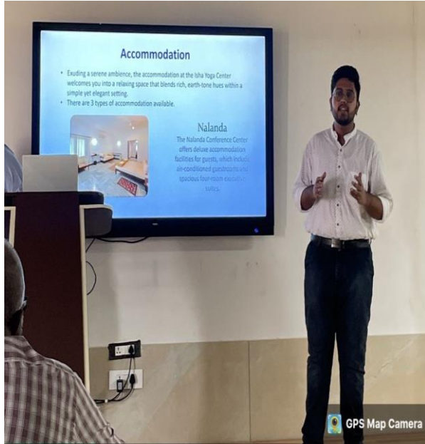
Guntur, AP, India KL Boys Hostel Road, Tadepalle, Guntur, 522302, AP, India Lat 16.443360, Long 80.621363 10/11/2023 02:50 PM GMT+05:30 Note : Captured by GPS Map Camera