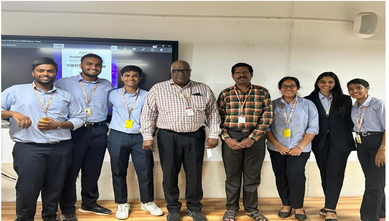
Activity: professional society activity on Virtual Tourism on 11-10-2023