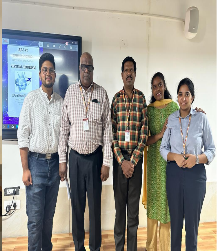
Guntur, AP, India KL Boys Hostel Road, Tadepalle, Guntur, 522302, AP, India Lat 16.443360, Long 80.621363 10/11/2023 02:50 PM GMT+05:30 Note : Captured by GPS Map Camera