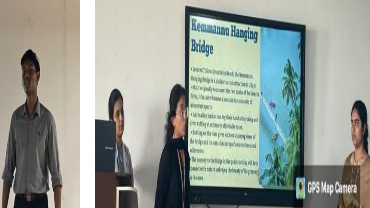
Guntur, AP, India KL Boys Hostel Road, Tadepalle, Guntur, 522302, AP, India Lat 16.443351, Long 80.621386 10/10/2023 15:16 GMT+05:30