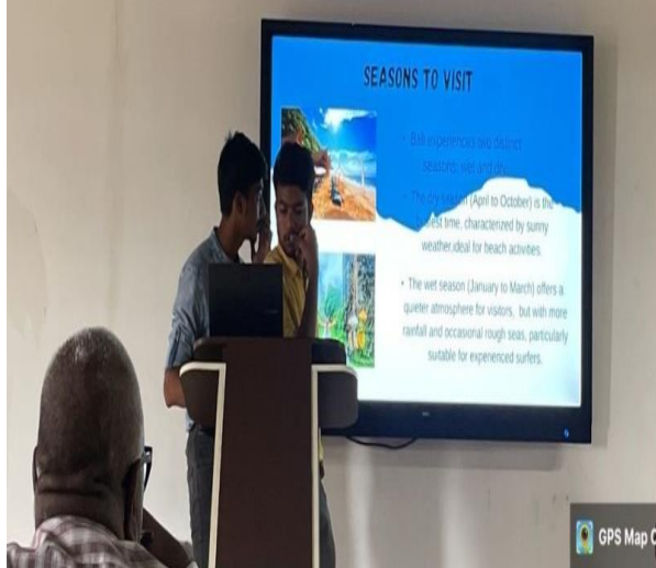
Guntur, AP, India KL Boys Hostel Road, Tadepalle, Guntur, 522302, AP, India Lat 16.443328, Long 80.621361 10/11/2023 03:00 PM GMT+05:30 Note : Captured by GPS Map Camera